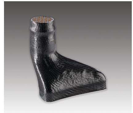
Figure 2: The composite material is then wrapped around the sacrificial tool as shown. Once the part is fully formed and cured, the tool is ready for wash-out.