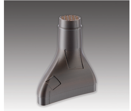
Figure 1: FDM sacrificial tooling begins with a 3D printed tool, which features a standard fill pattern designed to promote fluid flow during the tool removal process and provide adequate strength during elevated temperature, high pressure cure cycles.

Fine details. Smooth surface finishes. Accuracy. Strength. The best way to see the advantages of a Fortus 3D Printer is to have your own part built on a Fortus system. Get your free part at: stratasys.com .